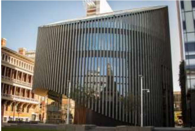
New City of Perth Library, Cathedral Square

This month I'd like to touch on the topic of libraries. Has the age of the worldwide web made physical libraries redundant? Those born before 1993, the so-called Google generation, have no recollection of life before the word wide web. The Google generation doesn't spend too many hours hanging out in dusty libraries, like our beloved old RUSI WA Library. Even our own pre-Google generation RUSI WA members have voted with their feet over recent years and our library has seen little use.